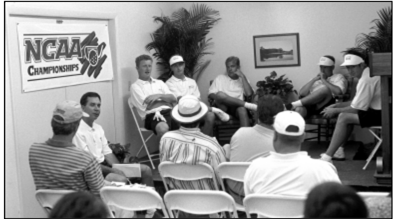
The Bucs earned quite a media following in their quest for a national championship in 1996.