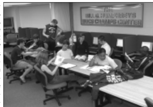
The state-of-the-art Bill G. Humphreys CHAMPS Life Skills Center was completed in the spring of 2003.

planning, leadership development, eating disorders, domestic violence and sexual assault prevention. Many of these sessions are developed "in-house" through the Academic Services and Life Skills program office, but the emphasis has been on building connections across campus. The goal of the entire campus network is to make sure that student-athletes are aware and utilize the resources and programs that are available to them.